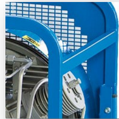
Powder Coated Steel Frame