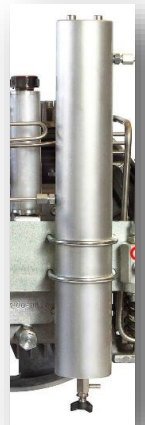
Maxi Filter System (5x bigger than a standard filter system)